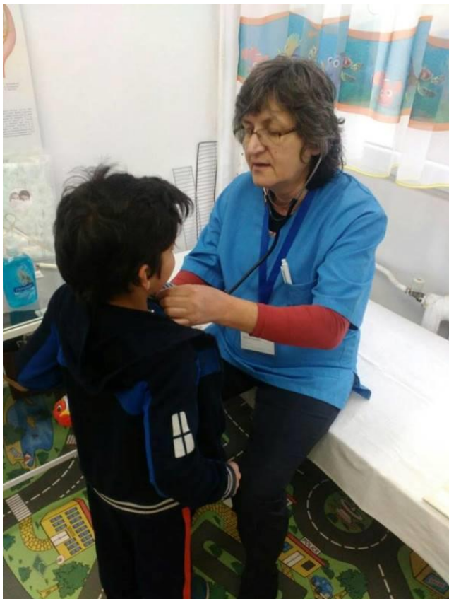
Profilactic examinations in Ruse