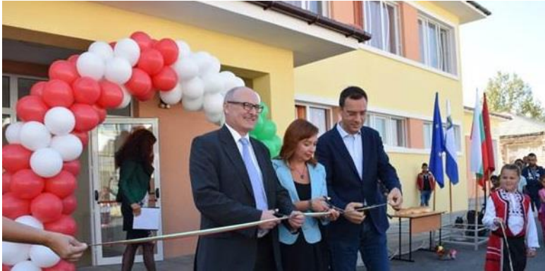
School extension in Burgas