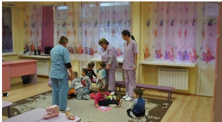
Nursery groups in Ruse